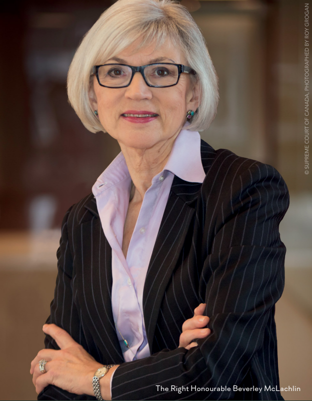
The Right Honourable Beverley McLachlin

iderer@dererlaw.com • marney@marneylutzmediation.com Studio Bell 850 4 th St SE Calgary, AB T2G 0L8